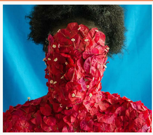
Hyper-visible for punitive policies

Black girls are more likely to report being forced to have sexual intercourse and involved in dating violence than white girls or other girls of color